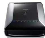
CanoScan 9000F Mk II CanoScan LiDE 220 CanoScan LiDE 120