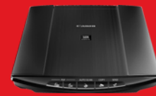
CanoScan LiDE 220