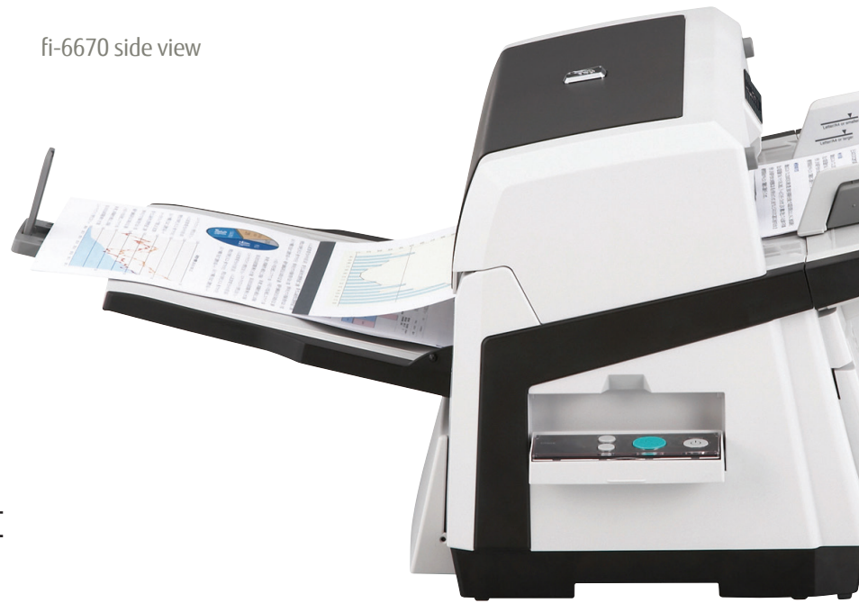
fi-6670 side view