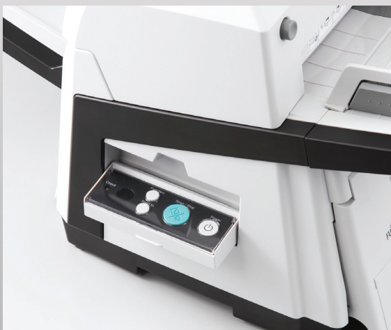
fi-6670 control console

Ultrasonic double-feed detection comes as standard with both models and this ensures that if sensors detect that a double feed is about to occur then the scanning process is stopped early. This helps to prevent the unintentional loss of information in scanned results and before any damage to the document occurs. Additionally advanced intelligence can be applied which enables the sensors to be set up to help identify and subsequently ignore attachments such as sticky notes or items with a photo attached that would otherwise cause disruptions to the scanning process.