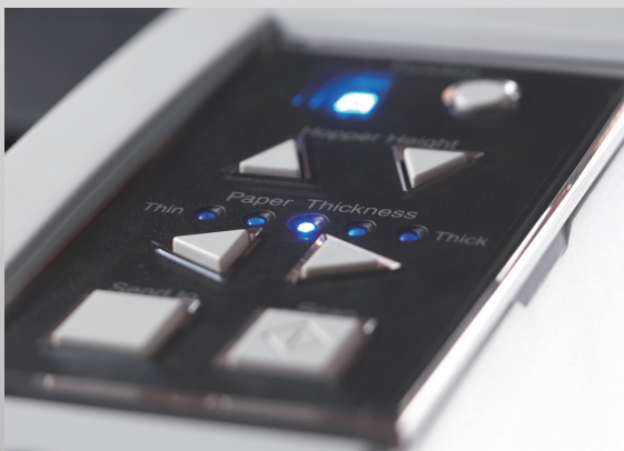
Integrated operating panel