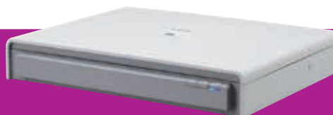
A3 Flatbed Scanner unit 201