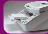
Middle position (300 sheets)