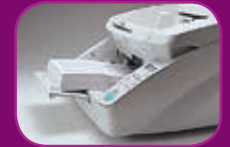
Lowest position (500 sheets)