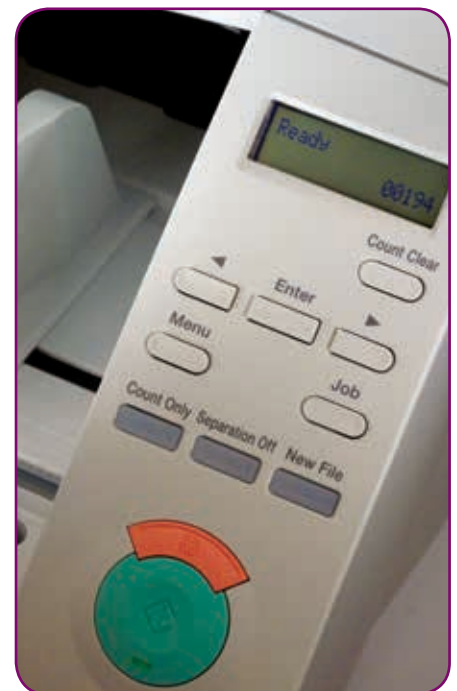
User-friendly control panel

Both the DR-G1130 and DR-G1100 come with an array of intelligent image processing features, including advanced deskew to straighten documents that are fed in at an angle, MultiStream to create dual image outputs for OCR applications and Character Emphasis to improve legibility for better OCR recognition.