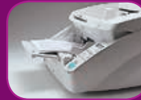
Highest position (100 sheets)

The document feeder has three selectable feeding modes (100, 300 and 500 sheets) that are adjustable according to the volume of the batches being scanned, saving time and increasing overall throughput.