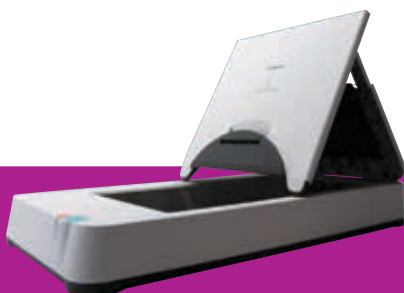
A4 Flatbed Scanner Unit 101

Scan bound books, journals and fragile media by adding the Flatbed Scanner Unit 101 for documents up to A4 or Flatbed Scanner Unit 201 for A3 scanning. Connected by USB, these flatbed scanners work seamlessly with the DR-G1130 and DR-G1100 in a smooth dual-scanning operation that lets you apply the same image-enhancement features to any scan.