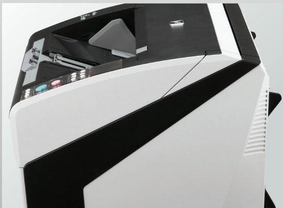
fi-6800 side view

Operators can manage mixed document batches efficiently when the physical characteristics of documents change within the batch. The fi-6800 handles different sized sheets from A8 to A3 and differences in materials such as when paper, card and plastic vary in weight and thickness – leaving the operator free to attend to parallel tasks without being distracted by avoidable misfeed alerts.