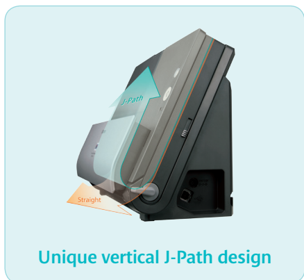
Unique vertical J-Path design

The vertical J-Path design allows documents to be fed and received vertically, so no extra desk space is required. Side-mounted cables and ports let you place both devices directly against a rear wall, or even on a shelf, for the ultimate in space-saving convenience.