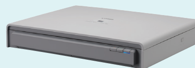
A3 Flatbed Scanner unit 201